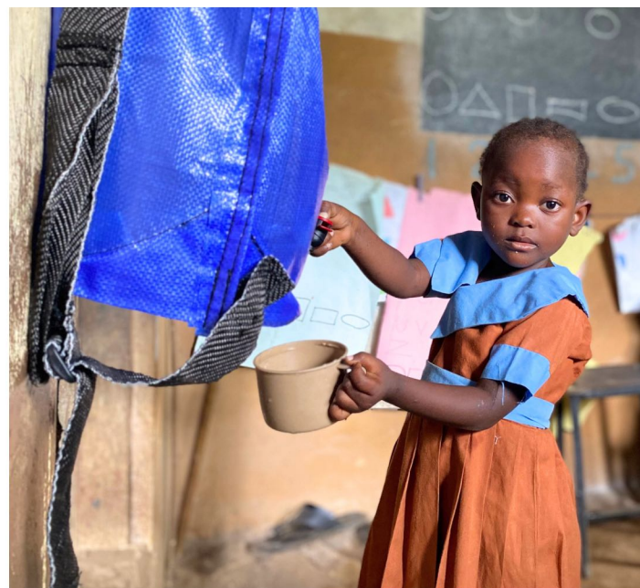
A little girl gets water from a WaterSafe backpack in her classroom

We plan to place a WaterSafe backpack in each classroom in Kenya, giving school children safe drinking water.