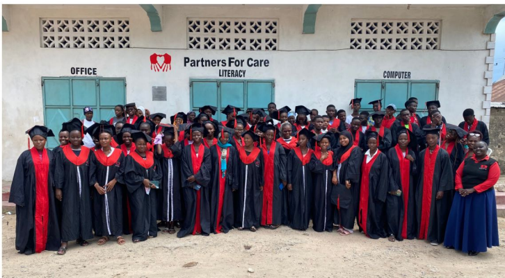
Nairobi Computer School graduation, August 2024

Your contributions really do change lives in lasting ways!